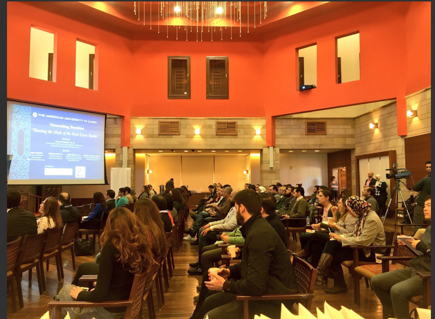
Moataz Al Alfi Hall