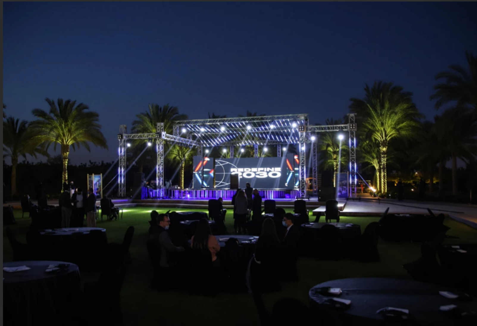
AUC Library Gardens